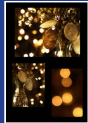
Ashley Hardy 11 PM Lights Color Digital Photographs 18" x 24"