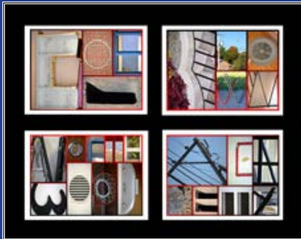
Andrew Lambert CBNA Snapshot Color Photographs 22" x 28"

Exhibitions & Competition Opportunities include: The Scholastic Art Awards of NH Congressional Competition and others as become available