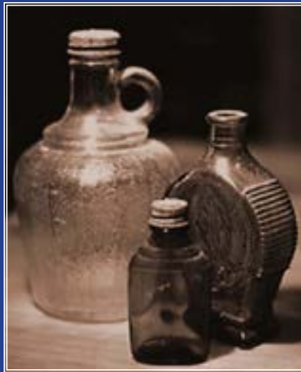
Taylor Trainor Sepia Toned Bottles Sepia Toned B & W Analog Photograph 14" x 11"