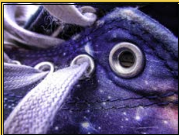
Amelia Emonds A Walk in the Galaxy Digital Color Photograph 8.5" x 11"