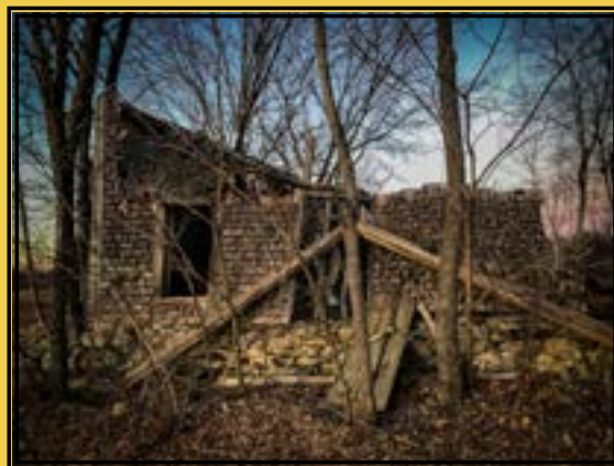
Eva Roy Ruined Greif Digital Color Photograph 13" x 19"

Exhibition & Competitions Opportunities include: The Scholastic Art Awards of NH Congressional Art Competition and others as appropriate