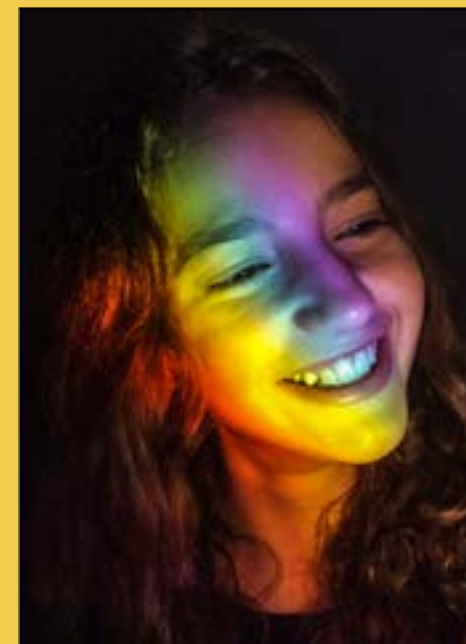
Madelynn Peabody The Colors of Lilly Digital Color Photograph 19" x 13"